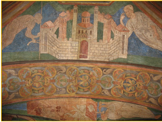
Heavenly Jerusalem, ca. 1173, St. Maria and St. Clemens church, Schwarzhheindorf, Germany