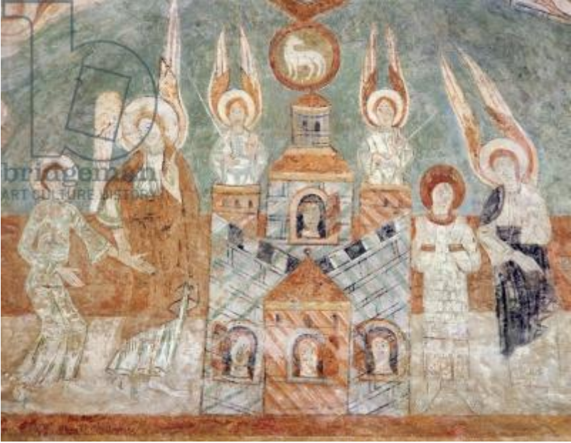
Christ in Majesty and the Heavenly Jerusalem, ca. 1120, Abbey Church of Saint-Chief, France