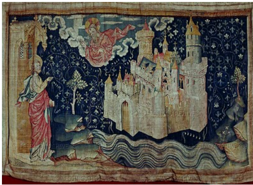
Jean Bondol and Nicholas Bataille, The Descent of the Celestial Jerusalem , From the Angers Apocalypse tapestries, ca. 1375-1390